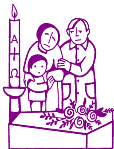
Bury the dead

The parish organisers and cantors meet on 8th November at 8 pm .