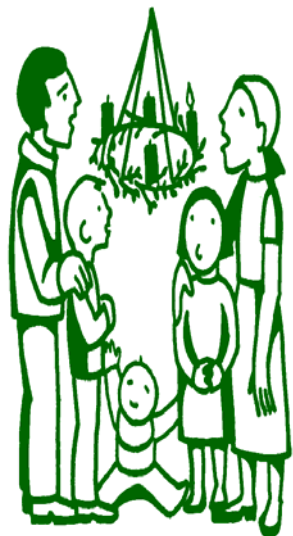
O come, O come Emmanuel